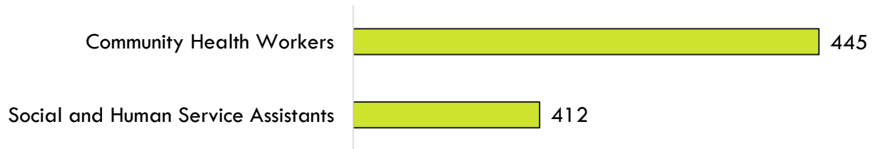
Exhibit 6: Job postings by occupation (last 12 months), Los Angeles and Orange counties

Job postings were analyzed for the most common job titles, skills, and employers associated with the target occupations in this report (Exhibit 7).