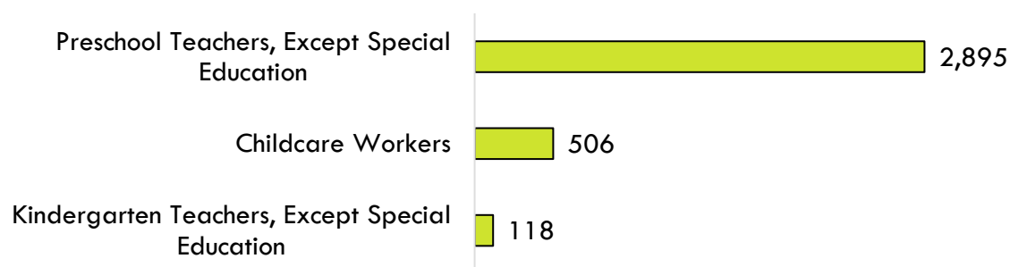
Exhibit 6: Job postings by occupation (last 12 months), Los Angeles and Orange counties

Job postings were analyzed for the most common job titles, skills, and employers associated with the target occupations in this report (Exhibit 7).