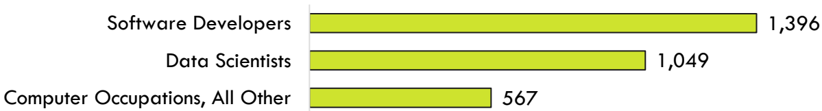
Exhibit 6: Job postings by occupation (last 12 months), Los Angeles and Orange counties

Job postings were analyzed for the most common job titles, skills, and employers associated with the target occupations in this report (Exhibit 7).