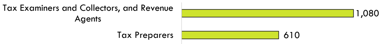
Exhibit 5: Job postings by occupation (last 12 months)

There were 1,690 online job postings for middle-skill tax occupations listed in the past 12 months. Exhibit 5 displays the number of job postings by occupation. The majority of job postings (64%) were for tax examiners and collectors, and revenue agents , followed by tax preparers (36%). The highest number of job postings were for tax preparers, tax associates, tax professionals, lead tax preparers, and revenue specialists. The top skills were accounting, preparation, tax returns, auditing, and finance. The top three employers, by number of job postings, in the region were H&R Block, KPMG, and Jackson Hewitt.