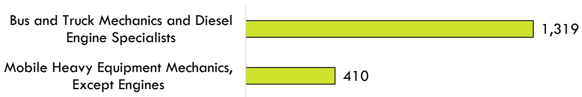
Exhibit 5: Job postings by occupation (last 12 months)

There were 1,729 online job postings related to heavy truck maintenance listed in the past 12 months. Exhibit 5 displays the number of job postings by occupation. The majority of job postings (76%) were for bus and truck mechanics and diesel engine specialists , followed by mobile heavy equipment mechanics, except engines (24%). The highest number of job postings were for diesel mechanics, diesel technicians, heavy equipment mechanics, diesel mechanic technicians, and diesel truck and trailer mechanics. The top skills were diesel engines, brakes, equipment repair, preventative maintenance, heavy equipment, and vehicle suspension. The top three employers in the region, by number of job postings, were First Student, GPAC (staffing company), and MV Transportation.