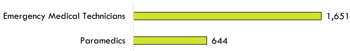
Exhibit 5: Job postings by occupation (last 12 months)

There were 2,295 online middle-skill job postings related to emergency medical services occupations listed in the past 12 months. Exhibit 5 displays the number of job postings by occupation. The majority of job postings (72%) were for emergency medical technicians , followed by paramedics (28%). The highest number of job postings were for emergency medical technicians-basic, emergency medical technicians, paramedics, emergency response managers, and special events managers. The top skills were ambulances, cardiopulmonary resuscitation (CPR), medical assistance, emergency medical services, and medical equipment. The top three employers, by number of job postings, in the region were AMR, Global Medical Response, and Liberty Ambulance.