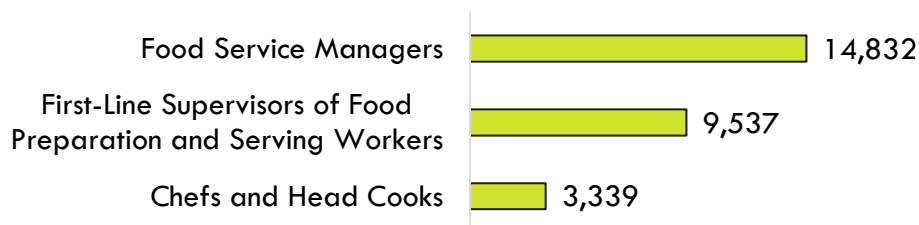
Exhibit 5: Job postings by occupation (last 12 months)

There were 27,708 online job postings for middle-skill culinary arts occupations listed in the past 12 months. Exhibit 5 displays the number of job postings by occupation. The majority of job postings (54%) were for food service managers , followed by first-line supervisors of food preparation and serving workers (34%) and chefs and head cooks (12%). The highest number of job postings were for shift leaders, general managers, assistant managers, restaurant managers, and assistant general managers. The top skills were restaurant operation, food safety and sanitation, restaurant management, food services, and marketing. The top three employers, by number of job postings, in the region were Domino's Pizza, Starbucks, and Taco Bell.