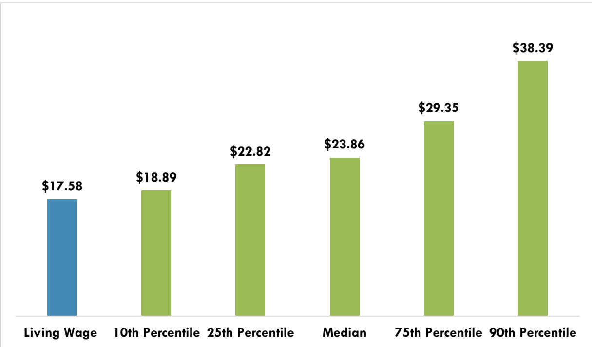
Exhibit 3b – Earnings for Paramedic in the South Central Coast Region

Source: Family Needs Calculator (Living wage is based on Single Adult households with no children); Lightcast™ Analyst 2022