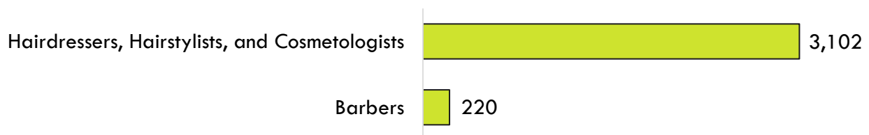
Exhibit 5: Job postings by occupation (last 12 months)

There were 3,322 online job postings related to barbering and hairdressing listed in the past 12 months. Exhibit 5 displays the number of job postings by occupation. The majority of job postings (93%) were for hairdressers, hairstylists, and cosmetologists , followed by barbers (7%). The highest number of job postings were for hair stylists, stylists, licensed hair stylists, hair stylists/cosmetologists, and barbers. The top skills were cosmetology, selling techniques, product knowledge, merchandising, and business development. The top three employers, by number of job postings, in the region were Great Clips, Sport Clips, and Supercuts.