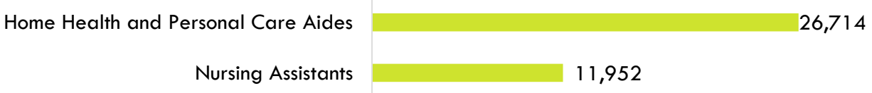
Exhibit 5: Job postings by occupation (last 12 months)