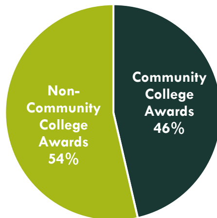
Exhibit 8: Community College Awards Compared to Non-Community College Awards in LA/OC Region, 3-Year Average

Exhibit 8 shows the proportion of community college awards conferred in LA/OC compared to the number of non-community college awards for the programs in this report. Nearly half of the awards conferred in these programs are awarded by community colleges in the LA/OC region.