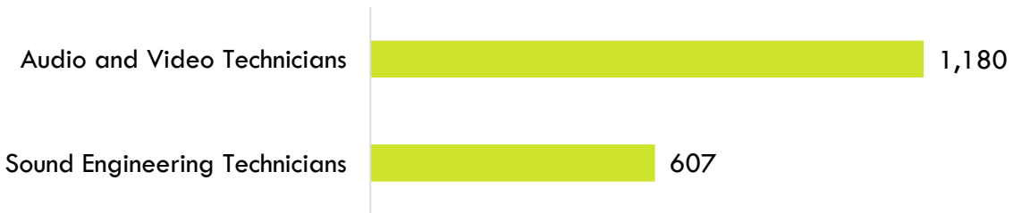
Exhibit 5: Job postings by occupation (last 12 months)

There were 1,787 online job postings related to commercial music listed in the past 12 months. Exhibit 5 displays the number of job postings by occupation. The majority of job postings (66%) were for audio and video technicians , followed by sound engineering technicians (34%). The highest number of job postings were for audiovisual technicians, audio engineers, audio video managers, theater technicians, and broadcast technicians. The top skills were audiovisual equipment, operations management, electronic components, workflow management, and Creston (A/V system). The top three employers, by number of job postings, in the region were Encore Global, Best Buy, and Disney.