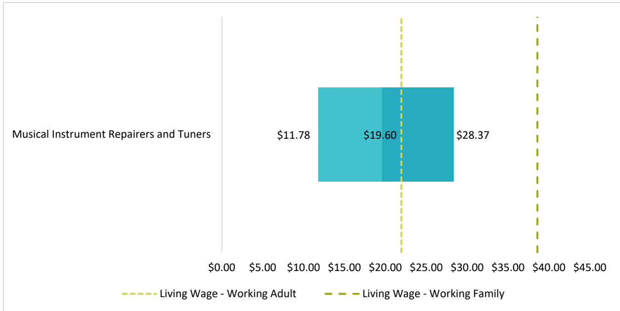
Exhibit 4. Median occupational earnings vs. Community College District's County living wage