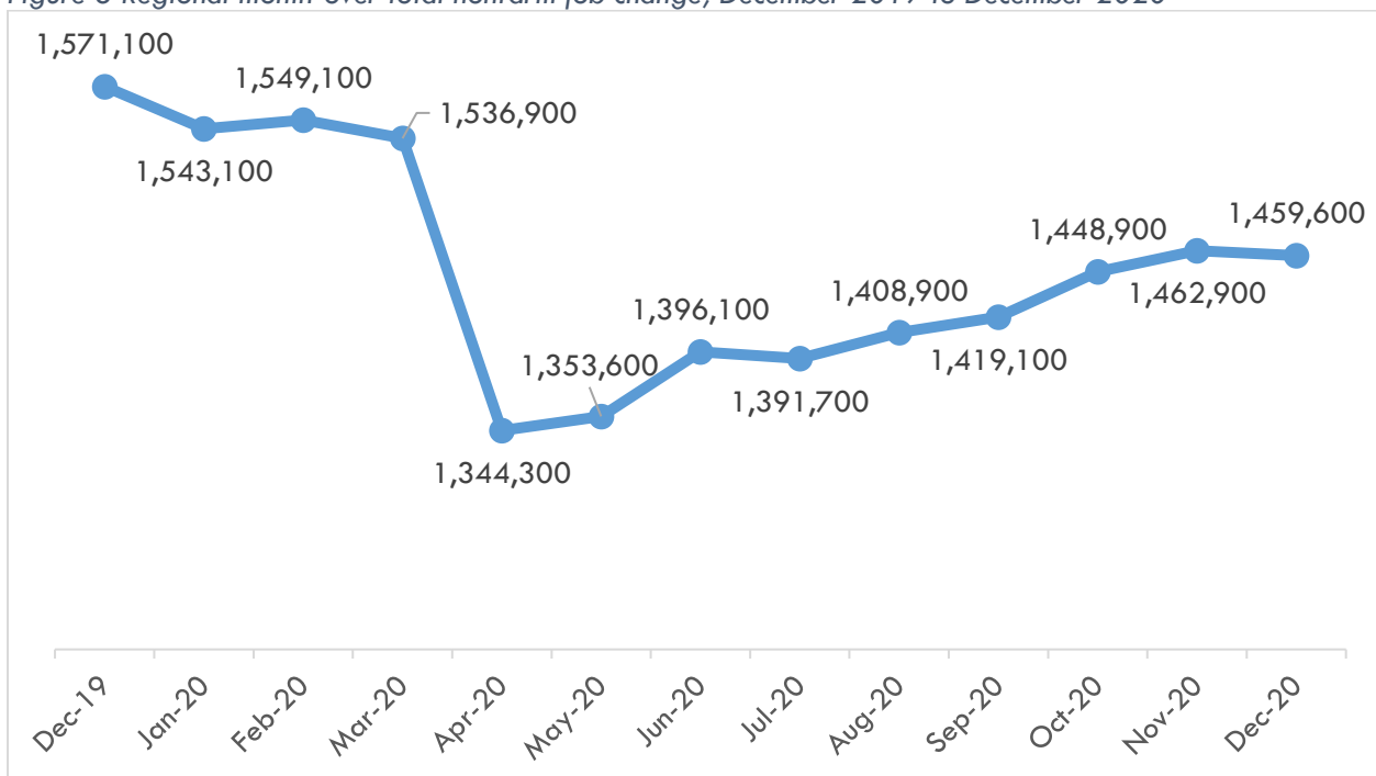
Figure 3 Regional month-over total nonfarm job change, December 2019 to December 2020

Regional nonfarm employer payrolls decreased by 3,300 jobs over the month , a 0.2% decrease. The region is down 111,500 jobs over the year or 7.1%. Farm employment was flat over the month but reported 700 fewer jobs over the year.